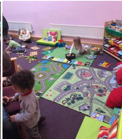
(Our well-loved pre-schoolers area on a Sunday)

Youth and Children's ministries have always been a significant aspect of church life, and for many years that has included a full time Youthwork Leader, and more recently a part-time Children & Families Leader as well. They work directly with the youth and children, and their families, and encouraging, training and equipping teams of volunteers too.