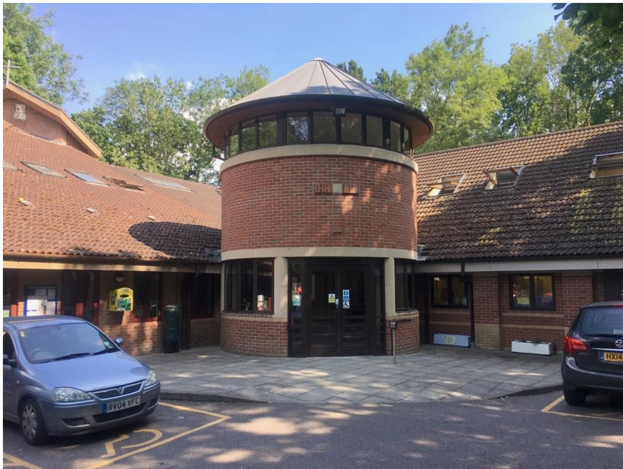
(the church's main entrance)

With a modern building, we're able to be more physically accessible, with level access, disabled toilet, and automatic doors. We're trying to become more accessible to people with special or additional needs in services and events, with some Makaton signing of songs, and we're learning how to support people with hidden needs, including autism and dementia.