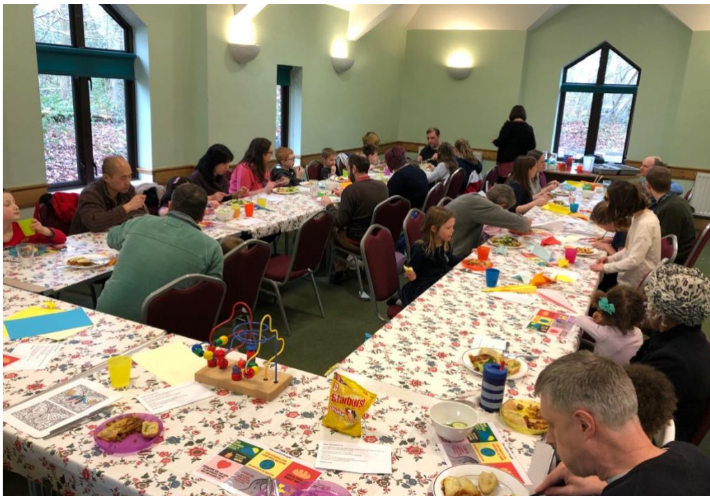
A Faith in Families lunch

As well as some of the above, our family work has included parenting courses, and a recently-started 'Faith in Families' lunch where we serve Sunday lunch to our families, giving us an opportunity to discuss our work and plans with parents, and how things are going with their role disciplining their children most of the week.