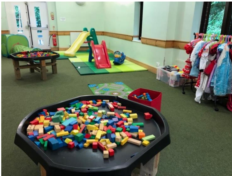
(Setting up for mid-week Sparklers)

We enjoy the life and noise of children and youth, and try hard to make them all feel welcome.